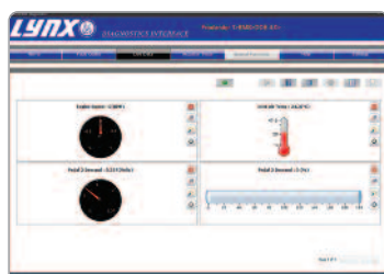
View live data with intuitive interface